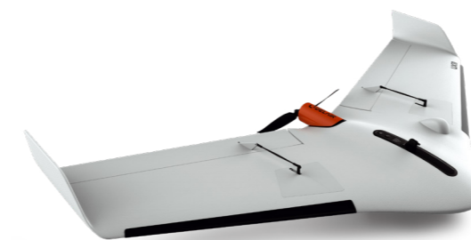
UX 11 1H Lightweight & Hand-launched

Our UAVs benefit from all the experience accumulated by Delair systems over more than 10 years in operational theaters: the ruggedness, reliability, aeronautical certification and stealthy that have made Delair's reputation, while offering a technological breakthrough that opens up new operational perspectives.