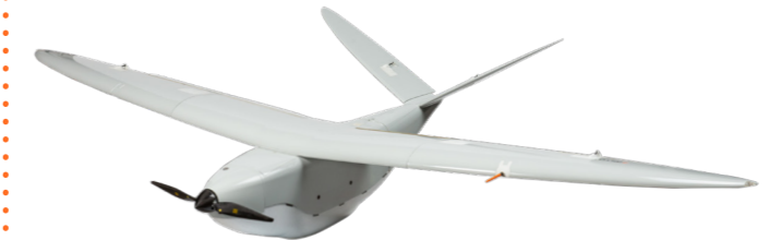
DT 26 E 3H Multimission ISR for long endurance